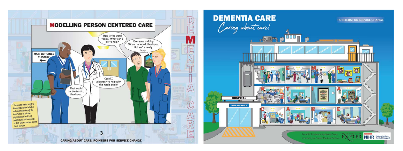
Figure 2. Extract from the Pointers for Service Change booklet on how to improve the experience of care for persons living with dementia in the hospital setting – showcasing 'Modelling person-centred care'.

Hospitalisation for an older adult with dementia remains very challenging. The environment is unfamiliar, routines are disrupted, and for many, their needs remain unrecognised or unmet. Furthermore, many may have superimposed delirium. Working out how best to improve their experience of care will take a systems wide approach that can bridge understanding the needs of the individual with the priorities of the acute care environment.